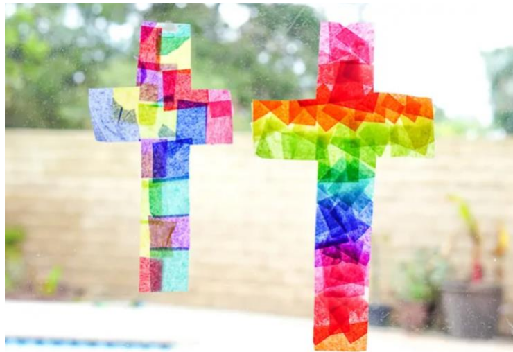
Image and craft instructions: https://www.madewithhappy.com/easy-easter-suncatcher-craft/

Cut out whatever shape you like: a cross, heart, sun, star. Punch a hole in the top and thread with a piece of ribbon. Hang in a sunny spot, such as a window.